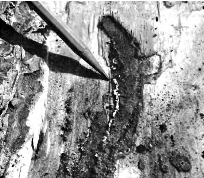
Figure 5. —Eggs of the black turpentine beetle along one side of its gallery. F-521397