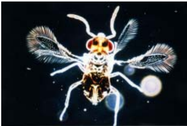
Adult of the aphelinid parasitoid, Aspidiotiphagus citrinus .

Control: Outbreaks of elongate hemlock scale often intensify following infestations of hemlock woolly adelgid, drought, or other stresses that have weakened the trees. Therefore, maintaining trees in healthy condition will discourage the buildup of scale populations. For example, hemlock have shallow roots and are consequently susceptible to drought, so ornamental trees should be watered during dry periods. However, applications of nitrogen fertilizer and broad-spectrum insecticides can exacerbate the pest problem. Nitrogen enhances the survival, development rate, and fecundity of F. externa , which results in higher scale densities on fertilized trees than on untreated ones. Also, inadequate pesticide application can cause resurgence in scale populations by eliminating natural enemies. The aphelinid parasitoid, Aspidiotiphagus citrinus Craw, consistently kills more than 90 percent of each generation of elongate hemlock scale in Japan. In the northeastern United States rates of parasitization are inconsistent (5-96 percent) because the life cycles of A. citrinus and F. externa are not synchronized. Two coccinellid beetles, the twice-stabbed ladybird beetle, Chilocorus stigma (Say), and Microweisea misella (LeConte), also attack F. externa in North America, but not frequently enough to control scale populations. Nevertheless, when broad spectrum or poorly applied pesticides eliminate these enemies, scale populations often rebound dramatically.