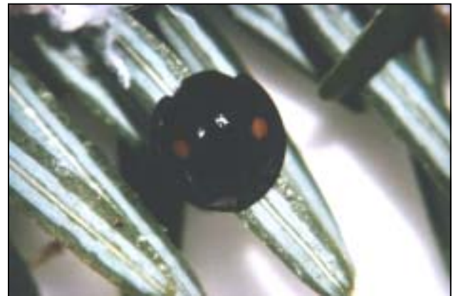
Adult of the twice-stabbed ladybird beetle, Chilocorus stigma .

Control of elongate hemlock scale is not possible in forests, but in ornamental plantings it can be controlled by thoroughly drenching trees with horticultural oil during early spring, when trees are dormant, and again, if needed, during the growing season. In forests, declining hemlocks should be salvaged to prevent buildup and spread of scale populations.