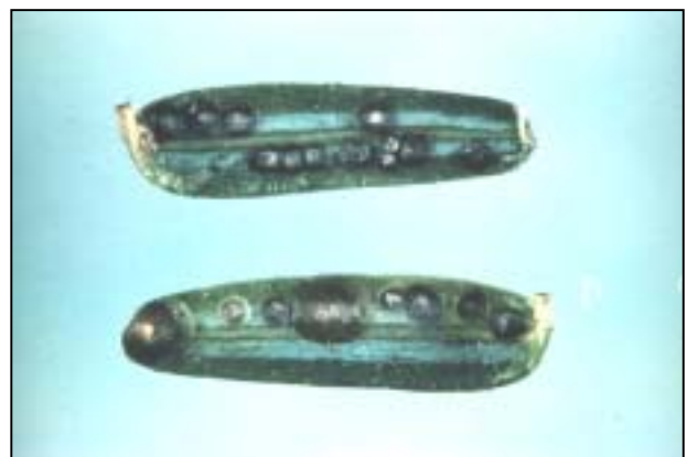
Nymphs and adults of circular hemlock scale, Nuculaspis tsugae , on the lower surface of hemlock needles.