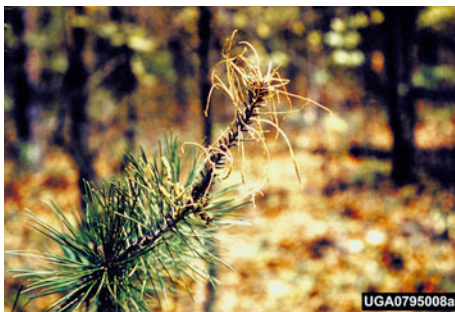
Fig. 2: Virginia Pine Sawfly eggs in pine needles